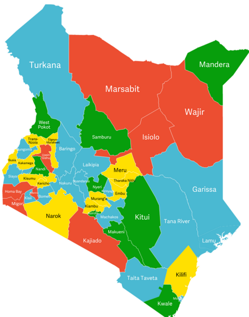
IBP Kenya's Performance Scale

● 81-100: A ● 61-80: B ● 41-60: C ● 21-40: D ● 0-20: E