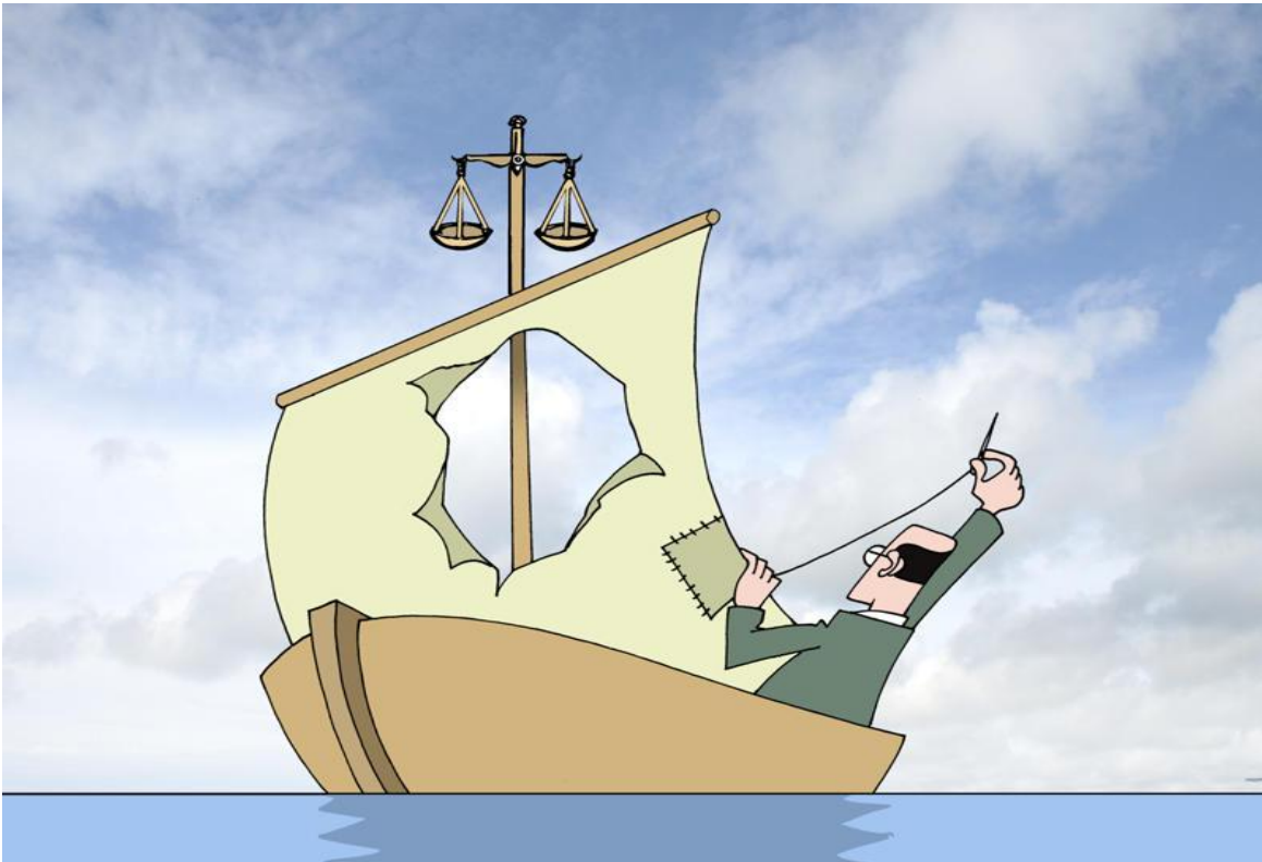
Figure 1: Ignoring the Root Cause Is a Sure Path to Failure!

To elaborate on these distinctions, please examine the following cartoon.