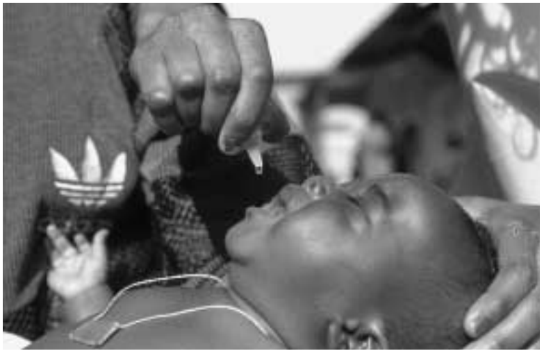
Drop by drop – the UN aims to reduce the proportion of people going hungry by half by 2015.