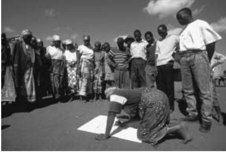
People planning - PRSPs are meant to be owned by governments and their citizens.