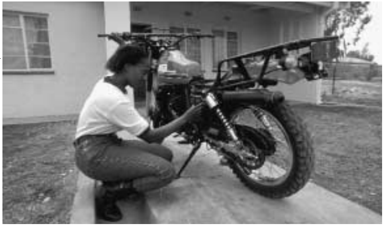
Women's work – 74 per cent of respondents said efforts were made in the PRSP process to encourage women's participation.

The respondents were also asked to say whether their editors felt the media had a role to play in the PRSP. Four answered positively, while two stated that the PRSP process had not been given sufficient publicity.