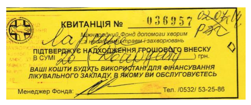
FIGURE 2: RECEIPT FROM THE CHARITABLE FUND OPERATING IN A HEALTH FACILITY IN POLTAVA

Translation: Receipt # 036957. International Fund for Traumas and Diseases. Confirms the receipt of a monetary contribution in the sum of 20 UAH ($1.30). Your funds will be used to finance the health facility, in which you are being serviced.