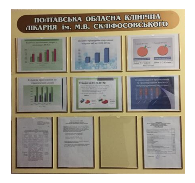
FIGURE 1: BULLETIN BOARD IN POLTAVA REGIONAL HOSPITAL DISPLAYING FINANCIAL INFORMATION RELATED TO THE CHARITABLE FUND

comply with the terms of the contract. Therefore, it continues to monitor these reports and to verify the information to the extent that is possible.